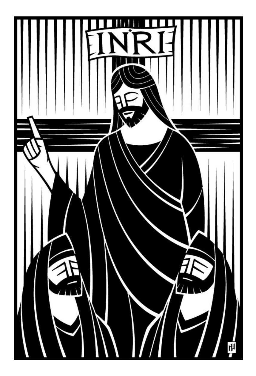
SHINING MOUNTAINS LUTHERAN CHURCH Bozeman, MT

The Thirteenth Sunday after Pentecost – August 22nd, 2021